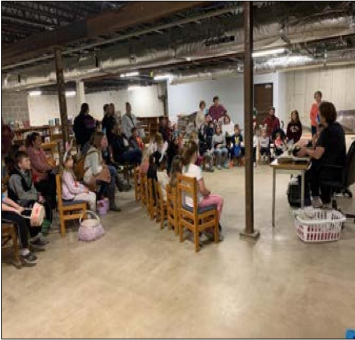
Program attended by 50 children