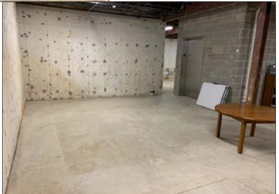
Open entrance area from elevator