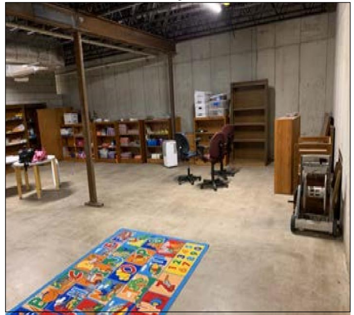
Northeast area for kitchenette and book room