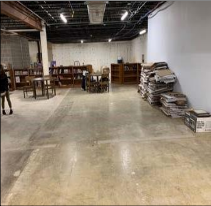
Middle section for community programs