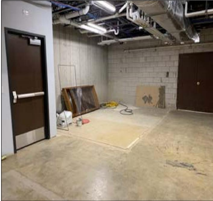
Northwest corner for 2 family-assist bathrooms