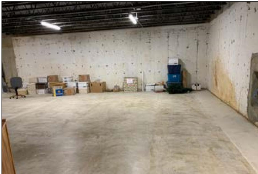
Southwest area for storage, possible meeting room